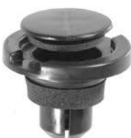
21501 (90914-0055) Black Nylon

Push-Type Retainer With Sealer Head Diameter: 25mm Shoulder Length: 3mm Shoulder Diameter: 16.5mm Stem Length: 16mm (Excluding The Pin) Fits Into 11mm Hole Subaru 2006 - On