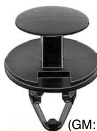
20993 (GM: 11589295; Ford: W712665-S300) Black Nylon

Fender, Flare, Gas Tank & Panel Attachment Push-Type Retainer Head Diameter: 25mm Stem Length: 20mm Panel Range: 3.0mm - 6.0mm Fits Into 10.5mm Hole Chevrolet Cobalt & HHR, GM C & K Trucks and Pontiac G5 2005 - On