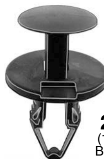
20994 (11589296) Black Nylon

Panel Attachment & General Purpose Push-Type Retainer Head Diameter: 25mm Stem Length: 23mm Panel Range: 6.0mm - 9.0mm Fits Into 10.5mm Hole Buick Enclave and GMC Acadia 2007 - On