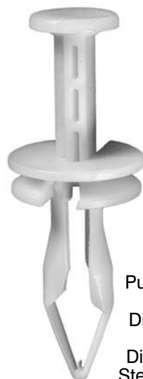
21400 (10426555) Natural Nylon

Refer To Push-Type Retainer Specification Chart On Pages 450 - 460