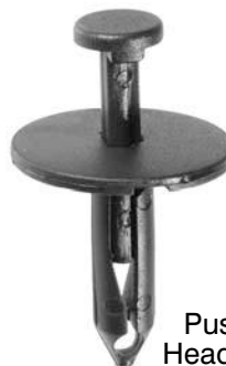
15701 (N804674-S) Black Nylon

Push-Type Retainer Head Diameter: 25mm Stem Length: 27mm Fits Into 7mm Hole Ford Mustang & Capri