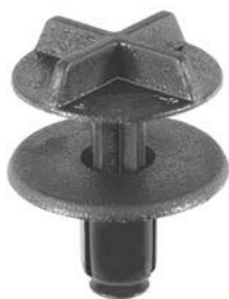
21176 (10382313) Black Nylon

Listed smallest to largest first by Head Diameter then by Stem Length and then by Hole Diameter