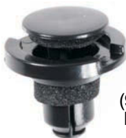
21576 (90914-0002) Black Nylon

Rocker, Pillar, Floor & Exterior Trim Push-Type Retainer With Sealer Head Diameter: 25mm Shoulder Diameter: 17mm Shoulder Length: 3mm Stem Length: 16mm (Excluding The Pin) Fits Into 11mm Hole Subaru B9 Tribeca, Baja, Legacy & Outback 2000 - On