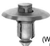
20233 (W705956-S300) Black Nylon

Cowl Push-Type Retainer Head Diameter: 25mm Shoulder Diameter: 10mm Shoulder Length: 3mm Stem Length: 12mm (Excluding The Pin) Fits Into 9mm Hole Lincoln LS 1999 - On