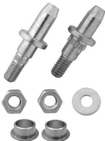
Not Actual Size

Detailed instructions are included with the kit.