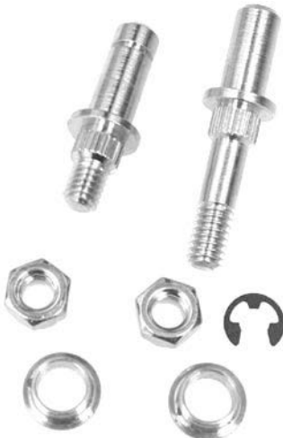
Not Actual Size