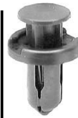
20564 (91503-SZ5-003) Black Nylon

Front Bumper Push-Type Retainer Head Diameter: 20mm Stem Length: 13mm Fits Into 10mm Hole Acura 3.5 RL Sedan & Honda 1996-On UNIT PACKAGE: 15