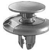
19239 (Honda: 91512-SX0-003; GM: 11519949; Mitsubishi: MU000319) Black Nylon

Front Bumper Cover Push-Type Retainer Head Diameter: 11mm Stem Length: 10mm Fits Into 8mm Hole Acura Legend, Honda Accord & Odyssey 1991-On UNIT PACKAGE: 10