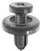
19232 (91502-SZ5-003) Black Nylon

Push-Type Retainer Head Diameter: 20mm Stem Length: 21mm Fits Into 8mm Hole Acura, Dodge Avenger, Eagle Talon, Geo Prizm, Mitsubishi Eclipse & Galant And Toyota 1993-On UNIT PACKAGE: 5