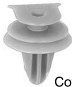
21059 (90602-S5A-003) Blue Nylon

Cowl Vent Retainer Top Head Size: 12mm x 13mm Middle Head Diameter: 16mm Bottom Head Diameter: 18mm Stem Diameter: 8.5mm x 8.5mm Stem Length: 14mm Acura RSX and Honda Civic & CR-V 2001 - On UNIT PACKAGE: 15