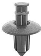
19231 (91505-SL0-003) Black Nylon

Front & Rear Bumper Push-Type Retainer Head Diameter: 20mm Stem Length: 15mm Fits Into 10mm Hole Legend 1991-On UNIT PACKAGE: 15