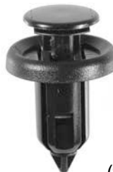
21173 (91506-S9A-003) Black Nylon

Front Fender Push-Type Retainer Head Diameter: 17mm Stem Length: 13mm Fits Into 7mm Hole 3.5 RL Sedan 1996-On UNIT PACKAGE: 10