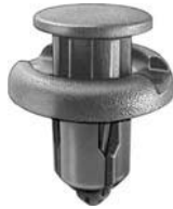
19233 (Acura: 91503-SZ3-003) Black Nylon

Cowl Vent Retainer Top Head Size: 12mm x 13mm Middle Head Diameter: 16mm Bottom Head Diameter: 18mm Stem Diameter: 8.5mm x 8.5mm Stem Length: 14mm Acura RSX and Honda Civic & CR-V 2001 - On UNIT PACKAGE: 15