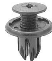
17267 (91503-SP0-003) Black Nylon

Bumper & Splash Shield Push-Type Retainer With Metal Insert Head Diameter: 20mm Stem Length: 16mm Fits Into 10mm Hole Acura MDX, RDX, TSX and Honda Accord, Civic CR-V & Fit 2009 - 04 UNIT PACKAGE: 10