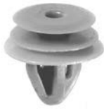
21188 (82315-27000) Pink Nylon

Trim Panel Retainer Top Head Diameter: 15mm Middle Head Diameter: 16mm Bottom Head Diameter: 18mm Stem Diameter: 10mm Stem Length: 12mm Hyundai and Ki 2003 - On