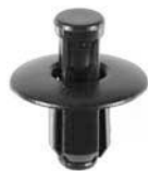
21328 (86155-2H100) Black Nylon

Cowl & Bumper Push-Type Retainer Head Diameter: 15mm Stem Length: 10mm Fits Into 7mm Hole Hyundai Genesis & Veracruz and Kia Rio 2009 - On