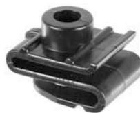
21378 (86825-28000) Black Nylon

Nylon "U" Nut M6 (#14) Screw Size Panel Size: Up To 1.5mm Center Of Hole To Edge: 8mm Hyundai Accent & Elantra and Kia 1995 - On