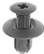
17632 (Mazda: B092-51-833; Ford: MB-455-56143, W705845-S300; Hyundai: 86590-28000) Black Nylon

Push-Type Retainer Head Diameter: 18mm Stem Length: 12mm Fits Into 8mm Hole Hyundai, Mazda & Ford Aspire