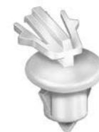
21243 (Not Available From O.E.M.) White Nylon

Moulding Clip Head Diameter: 15mm Stem Length: 14mm Fits Into 9mm Hole Infiniti 2006 - On