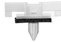
20961 (Not Available From O.E.M.) White Nylon

Drip Moulding Clip With Sealer Top Width: 25mm Overall Height: 16mm Fits Into 5mm Hole Infiniti M45, I30 & G35 2005 - On Nissan Altima, Maxima & 350Z 2002 - On