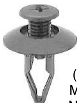
16858 (Kia: MNA01-56-145; Mazda: NA01-56-145; Nissan: 63844-01A00; Ford: MNA01-56145, NA01-56145) Black Nylon

Inner Fender Push-Type Retainer Head Dia: 20mm (25/32") Stem Length: 18mm (23/32") Fits Into 8mm (5/16") Hole Kia, Ford, Mazda & Nissan