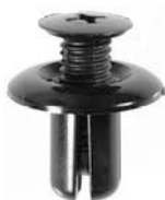
21146 (0G032-50037-A) Black Nylon

Bumper, Render, Grille, Interior & Exterior Trim and Pillar Push-Type Retainer Head Diameter: 18mm Stem Length: 12mm Fits Into 8mm Hole Amanti, Magentis, Optima, Rio, Sedona, Sephia, Sorrento, Spectra & Sportage 2000 – On