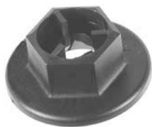
21372 (0K95A-68615) Black Nylon

Cowl Trim Retainer Flange Diameter: 25mm Hex Size: 14mm Overall Height: 10mm Forte Koup 2010 – On