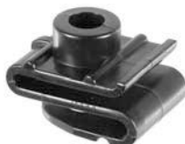
21378 (86825-28000) Black Nylon

Nylon "U" Nut M6 (#14) Screw Size Panel Range: Up To 1.5mm Center Of Hole To Edge: 8mm Hyundai Accent & Elantra and Kia 1995 – On