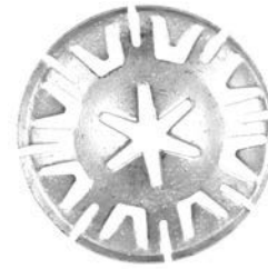
21513 (N90-335-006) Dacromet

Splash Shield & Wheel Well Push-On Retainer Stud Size: 5mm O.D.: 30mm VW & Audi