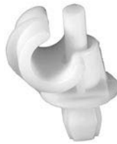
21483 (1H0-823-397) Natural Nylon

Hood Prop Rod Clip Rod Size: 8mm Stem Length: 10mm Fits Into 7mm Square Hole VW 1999 – 93