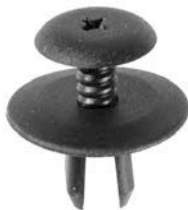
21482 (1H0-867-199-A) Black Nylon

Push-Type Retainer Head Diameter: 24mm Stem Length: 13mm Fits Into 9mm Square Hole Passat 1999 – 90