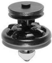
21251 (6Q0-868-243) Black & White Nylon

Trim Panel Push-Type Retainer With Sealer Head Diameter: 22.5mm Stem Length: 7mm (Not Including The Pin) Fits Into 8mm Hole Golf, Jetta, Passat, Phaeton, Rabbit & Tiguan 2004 – On