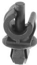
21514 (6N0-823-397-AC) Black Nylon

Hood Prop Rod Clip Rod Size: 8mm Head Diameter: 15mm Fits Into 7mm Square Hole VW & Audi