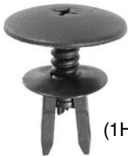
21452 (1H0-819-055-C01C) Black Nylon

Push-Type Retainer Top Head Diameter: 23mm Bottom Head Diameter: 16mm Stem Length: 15mm Fits Into 8mm x 8mm Square Hole VW 2002 – 1993